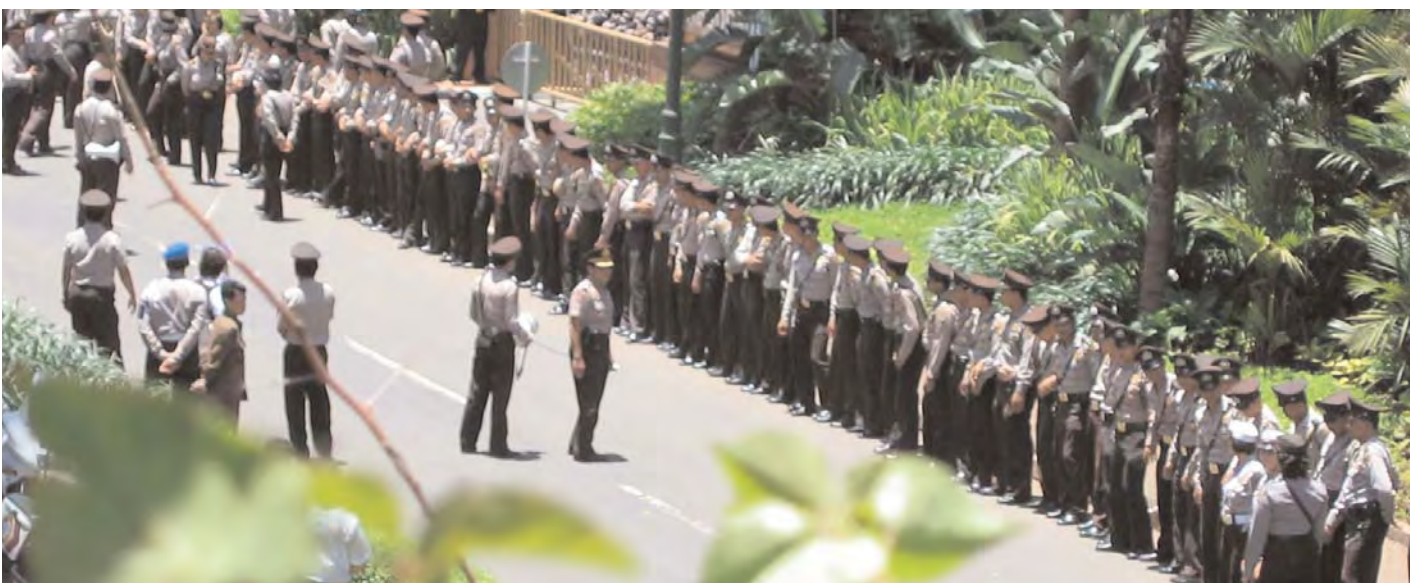
Security forces waiting for a demonstration against Freeport, Jakarta.