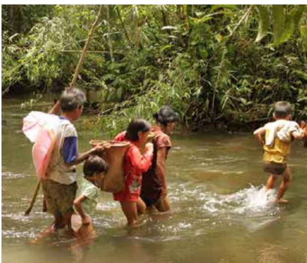
Indigenous Dayak villagers rely on the forest for food, water, non timber forest products and other sustenance.

The 7 concessions granted to BHP Billiton lie within the remote and largely undisturbed forests of central Borneo – forests recognised globally for their biodiversity. 2 The area is also