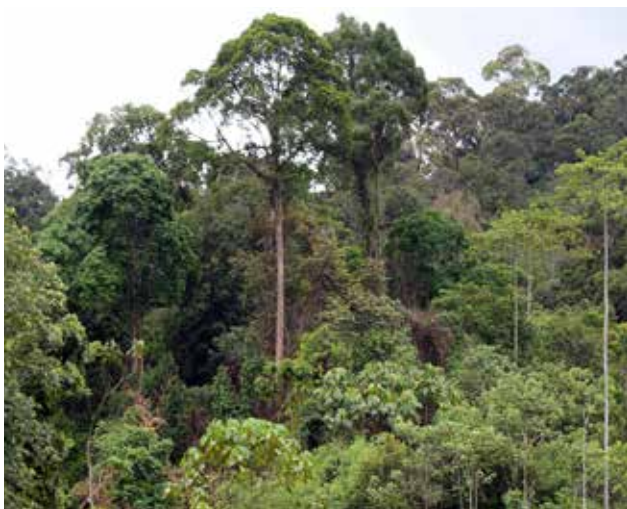
Rainforest such as this is threatened by BHP Billiton's IndoMet Project.

The Upper Barito Basin contains the traditional lands of a number of indigenous Dayak groups. For these people, local forests provide a principal source of subsistence, including extensive traditional forest gardens with native fruits, vegetables, nuts and herbs, numerous small-scale forest products, medicinal plants and selective timber harvested for local homes.