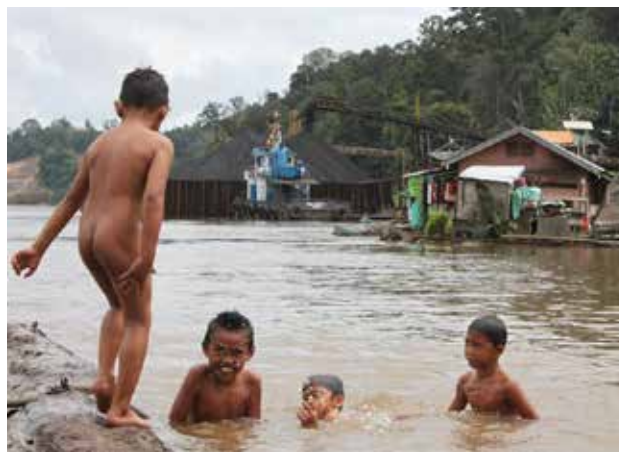
Children playing in the Barito River near a coal loading facility. If IndoMet goes ahead, their river could become more polluted.

In the wide-ranging forests outside villages, extensive communal hunting grounds supply pigs and deer, and the rivers that flow from these forests provide healthy fisheries and basic household water for drinking, washing, livestock and horticulture. For the indigenous Dayak groups these forests are traditional homelands, a source of material life, and a bedrock of cultural and spiritual sustenance in a rapidly changing world. The project will directly impact ten villages that live in and surrounding the concession areas, affecting an estimated 10,000 people.