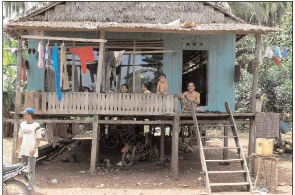
Living with wood chips: a village house near PT MAL's mill site, Pulau Laut, South Kalimantan. (DTE)

Firstly, it wants to build a 600,000 tonne per year bleached pulp mill in Satui