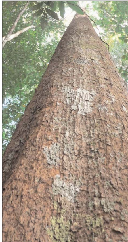
Dipterocarp at Kampung Endor Kerja (DTE)

The congress also aimed to produce an Indonesia Forest Accord, a declaration establishing the National Forestry Council, and the congress proceedings. 2