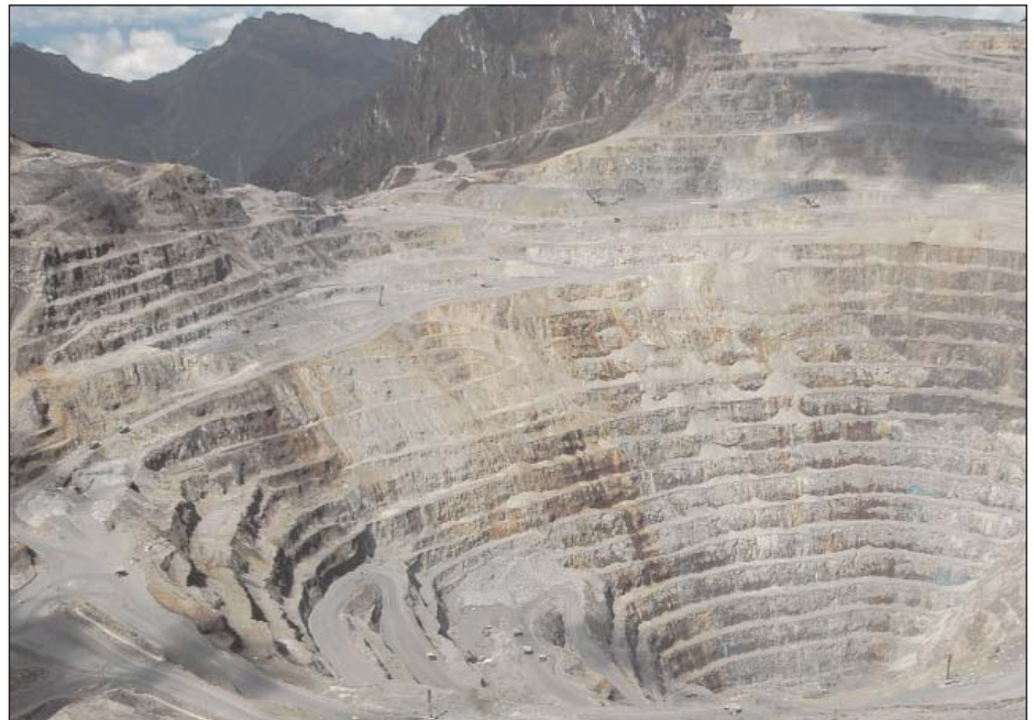
The massive Grasberg pit mined by Freeport-Rio Tinto in Papua

Increasingly these public funds, and many specialised 'ethical' private funds are being managed in accordance with the principles of