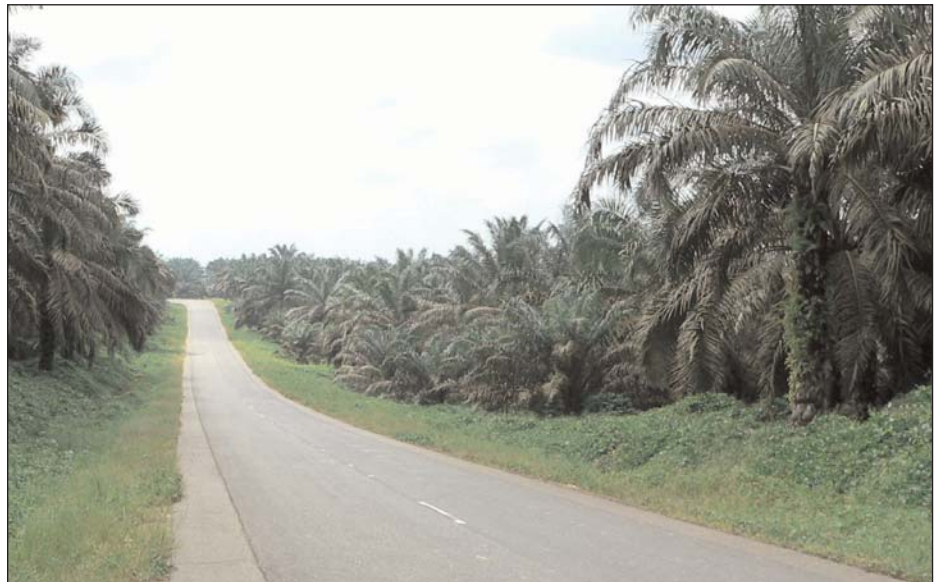
Oil palm plantation, Jambi, Sumatra.

Malaysia and Indonesia are the world's two big players in palm oil production, accounting for more than 80% of the total global trade. Indonesia is expected to overtake Malaysia soon as the world's biggest producer but the interests of both countries are closely linked as Malaysian companies are investing heavily in plantations in Indonesia. Indonesia's palm