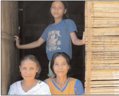
Niut indigenous women

President SBY on indigenous peoples - see p.10