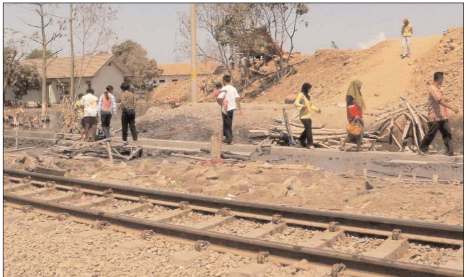
Railway line, Sidoarjo, with dead trees and levee in background, October 2006.

Things were to get even worse: in a press release dated October 18th, Lapindo reported that the mud had affected eight villages, covering an area of 400 hectares. Around 3,300 families (ca. 16,500 people) had been relocated. The company said that the displaced people had been moved into more permanent housing and were receiving rental